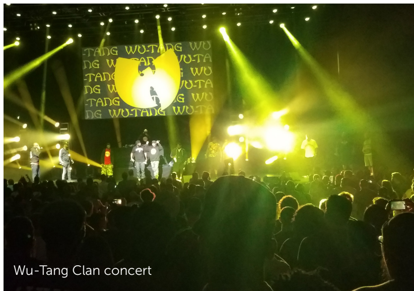
Wu-Tang Clan concert

The client was quite ambivalent about engaging in treatment, and team members almost had to stakeout her apartment at times to ensure that we met up with her. When we finally got her to agree to go at a program in Utah, we needed her to complete a physical, EKG and various labs prior to her admittance. The team had to work together to get both her buy-in on a daily basis and spent nearly 30 hours with her the last four days prior to going to Utah. We also had a staff