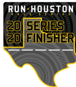
CUSTOM MEDAL DISPLAY